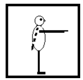
I acknowledge your white flag.